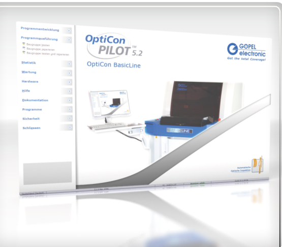
Software user interface OptiCon PILOT