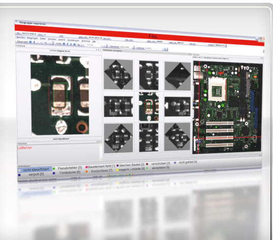
Repair station software