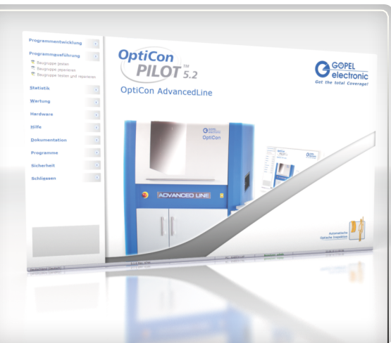
Software user interface OptiCon PILOT